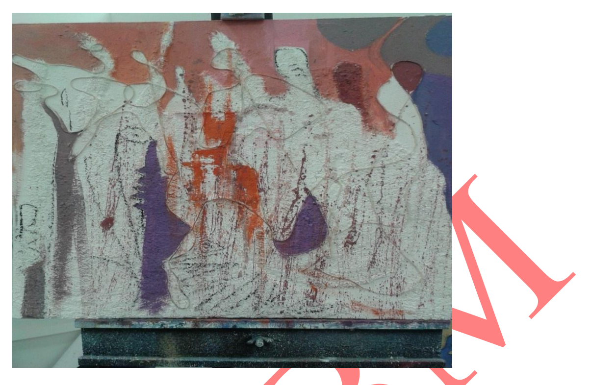
Fig: 4:0: AbiodunKafaru Ritual Performance Mixed Media on Wood

Also influence is the materials, employed in use for the artist's materials, (props and costume), the actors at such occasions, play out stories that the people are quite familiar with, events that has happened in the past or a commentary on on-going activities in the society. The above painting reveals the impacts of costume and props on the aesthetic qualities of performance.